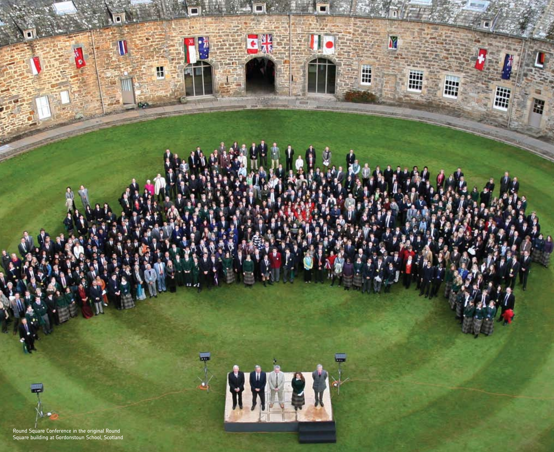
Round Square Conference in the original Round Square building at Gordonstoun School, Scotland